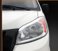
• Large Clear Headlights