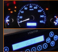
• Instrumental Cluster Gauge & Radio