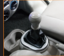
• 5-Speed Manual Floor Shift