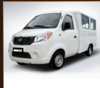
• New and Stylish Appearance