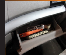
• Glove Box Compartment