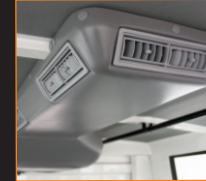
• MIT-AIR Aircondition System