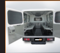
• Spray-on Bedliner Flooring