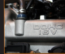
• 1.2L DOHC EFI Engine BOSCH Engine Management